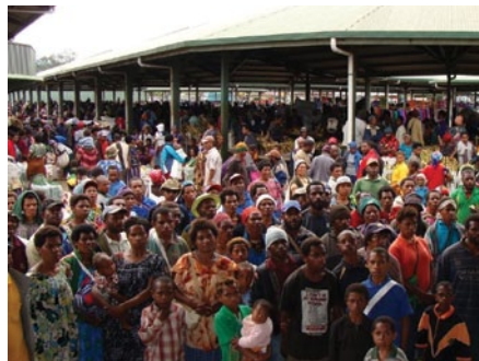
Local producers at Mt Hagan Fresh Food Market show great interest in the possibilities for supplying Alliance businesses with fresh produce.

The PNG LNG Project presents a real challenge to The Alliance Group in particular with providing adequate provision of food and produce to feed the thousands at numerous project sites.