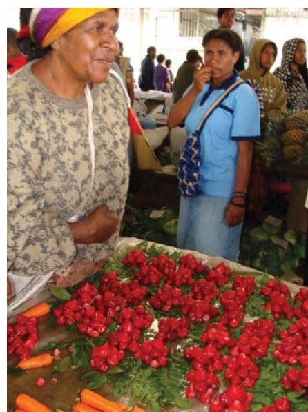
Fresh, quality produce in Mt Hagan.

Representatives from The Alliance Group recently commenced investigating opportunities with local businesses and family groups from Central Province for viable and sustainable commercial fishing and farming ventures. In the highlands, the team also visited Mt Hagen Fresh Food Market, holding talks with local representatives about how the local market works and opportunities for distribution further up the highlands to the other LNG camps and down to Port Moresby for the LNG Plant Site.